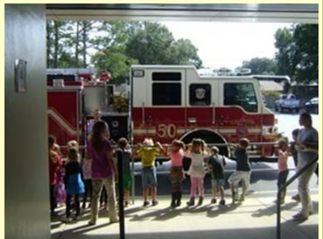
Clearwater Fire Dept. with our 1 st Graders